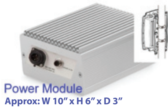
Figure 1-2, Outdoor Router Module (left), Outdoor Power Module (right)